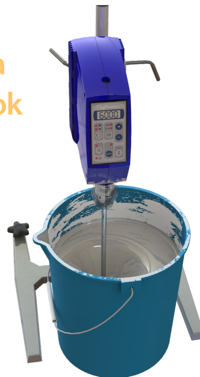
Dispersion of ceramic powders